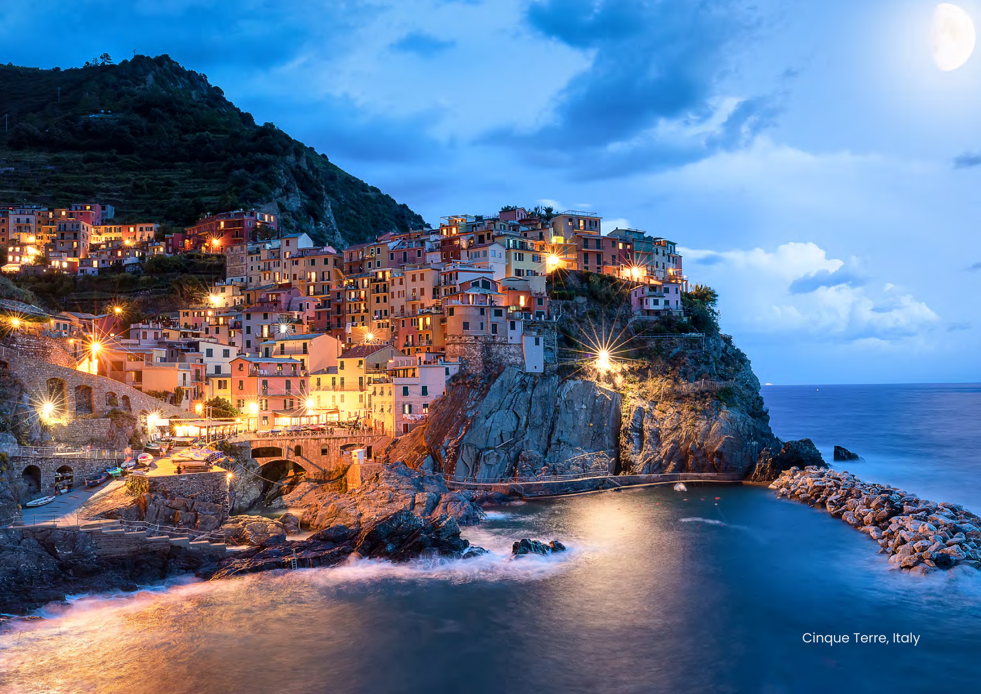
Cinque Terre, Italy