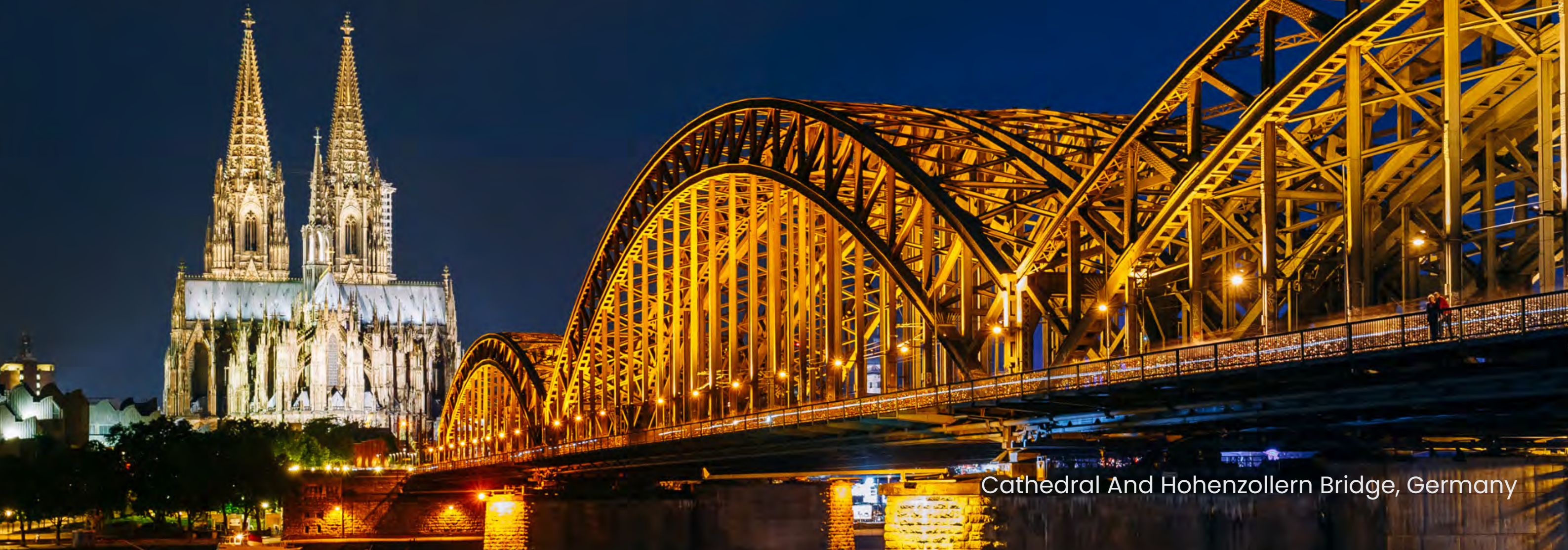
Cathedral And Hohenzollern Bridge, Germany

Europe is becoming increasingly popular as a study destination for students seeking a unique experience. There is something for everyone in Europe. Are you in?