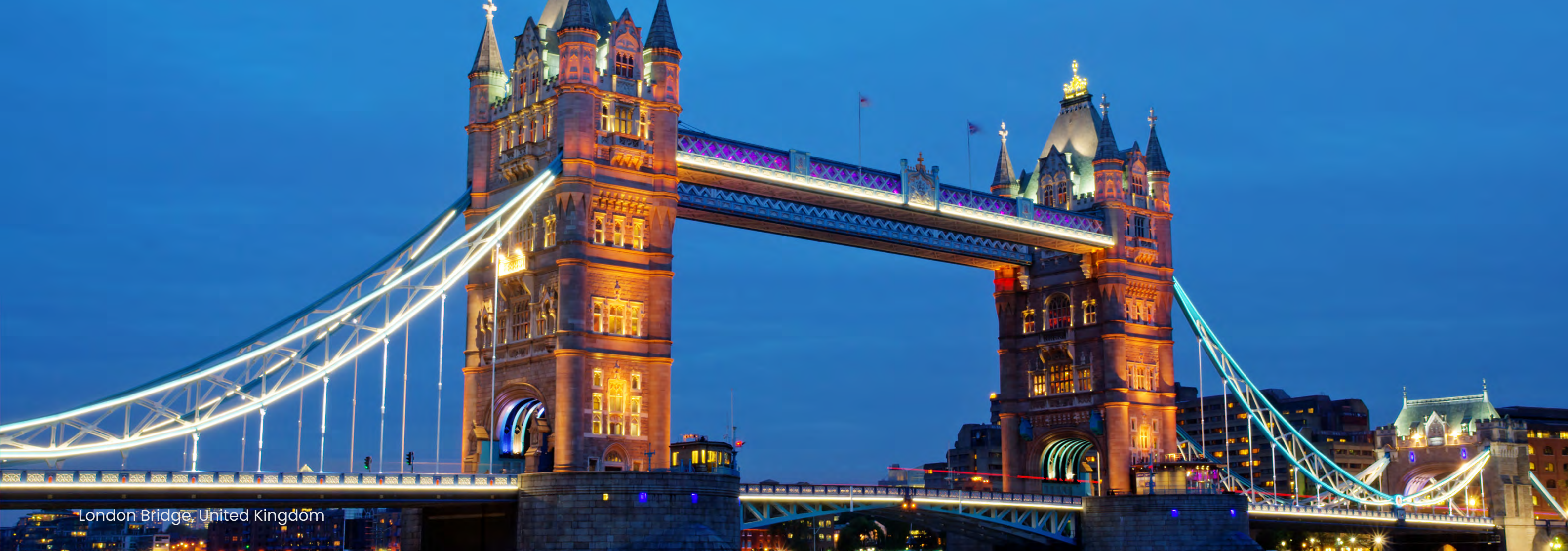
London Bridge, United Kingdom