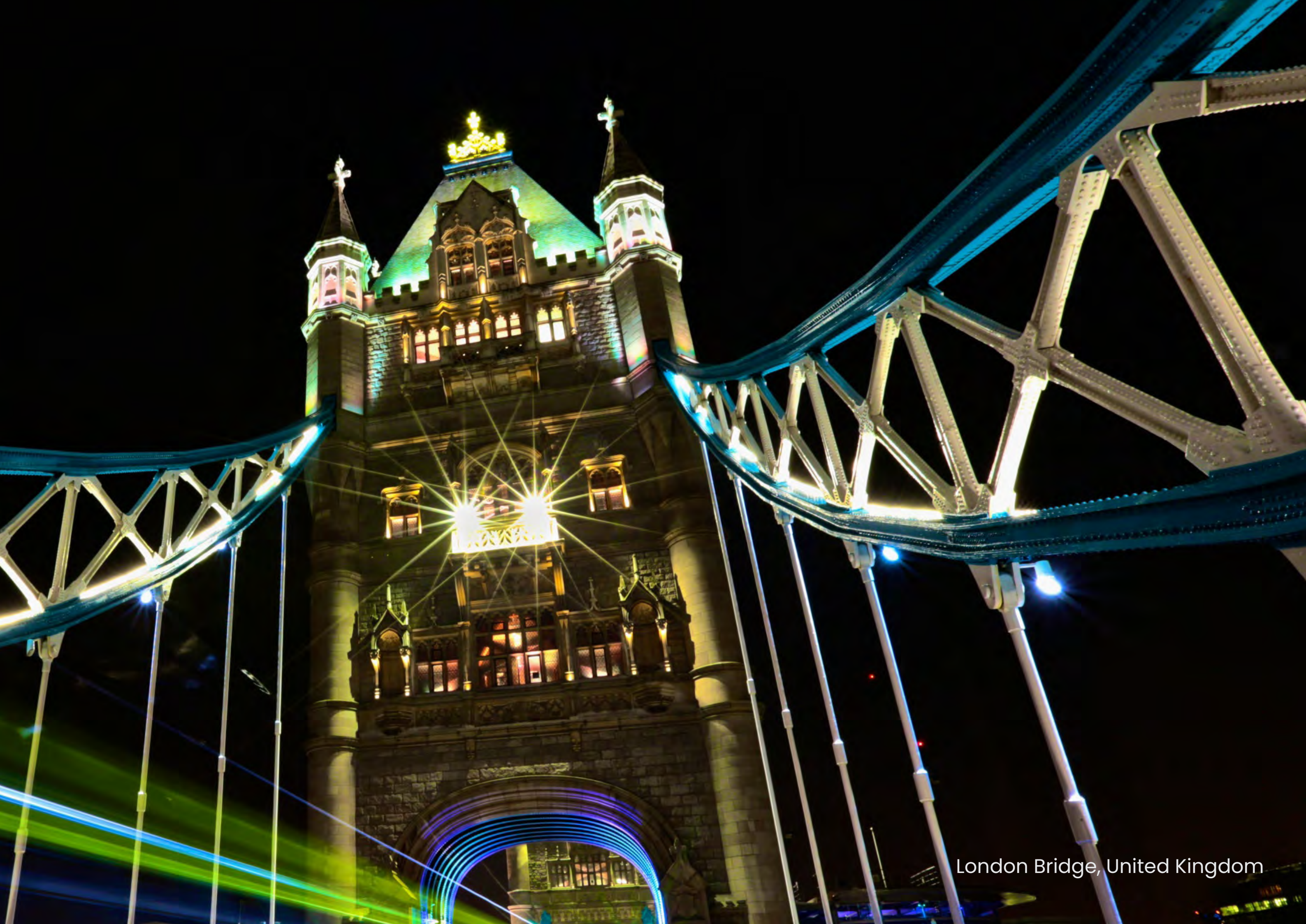
London Bridge, United Kingdom